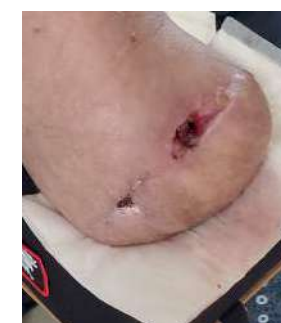
Right stump July 2022