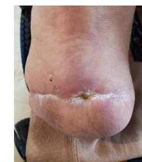
Right stump September 2022