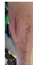
Left leg incision open