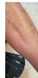
Left leg incision July 2022