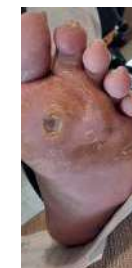
Left foot April 2022