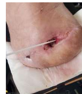
Right stump: depth of hole