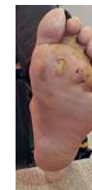
Left foot July 2022